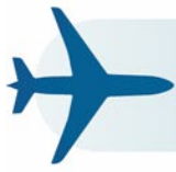
TABLE 2-15: AIRCRAFT PARKING (T-HANGARS AND CONVENTIONAL HANGARS)