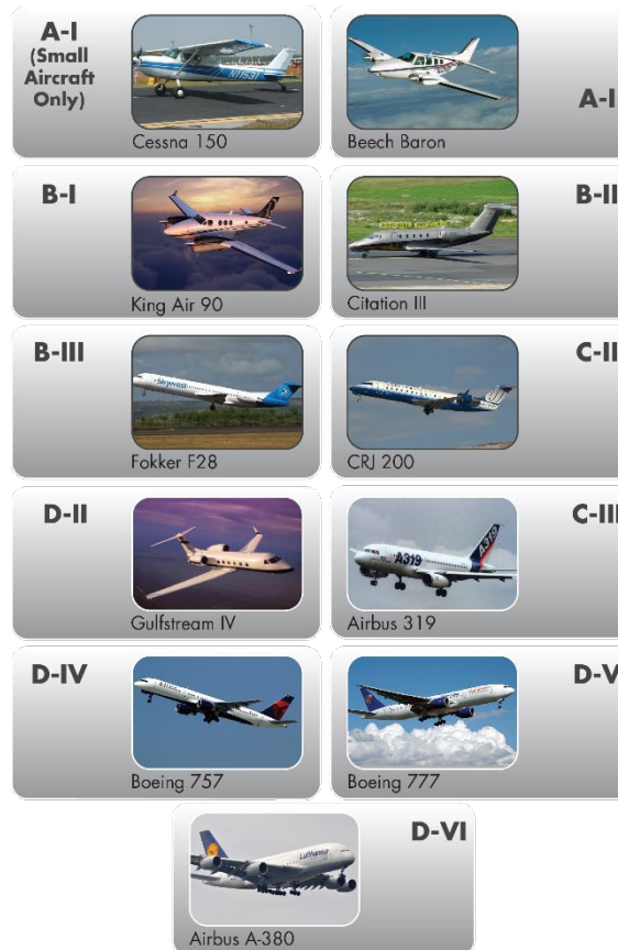
FIGURE 2-1: RUNWAY DESIGN CODE AIRCRAFT TYPES

Generally speaking, aircraft in Approach Category A and Design Group I are small general aviation aircraft. Most general aviation aircraft seldom exceed Approach Category C. Aircraft above Approach Category C are typically commercial aircraft, but some smaller commercial planes are included in Approach Category C. The higher the letter designation for the Approach Category and the higher the Roman Numeral for the Design Group, the larger the aircraft that the airport is designated to accommodate, as shown in Figure 2-1 .